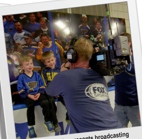
IBEW Local 4 represents broadcasting professionals throughout the St. Louis region, including camera operators, news videographers and assignment editors.